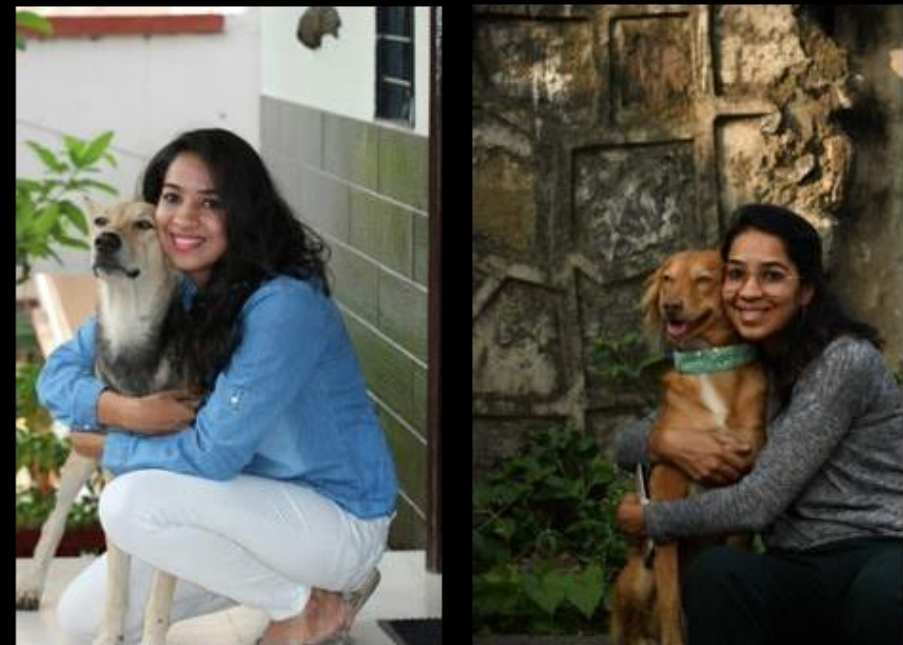
To See Our Work, Follow us on